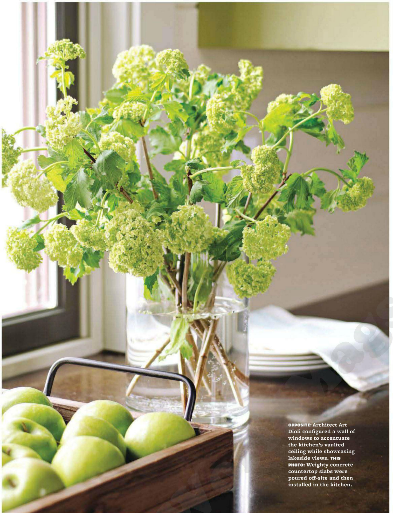
OPPOSITE: Architect Art Dioli configured a wall of windows to accentuate the kitchen's vaulted ceiling while showcasing lakeside views. THIS PHOTO: Weighty concrete countertop slabs were poured off-site and then installed in the kitchen.